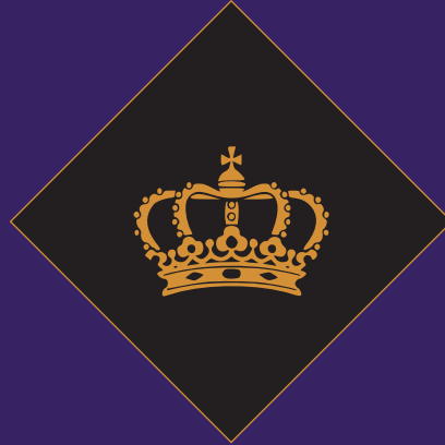
THE EMPEROR The might of ICNC 2024