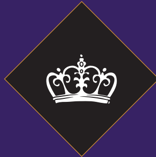
THE DUKES The strength of the ICNC 2024