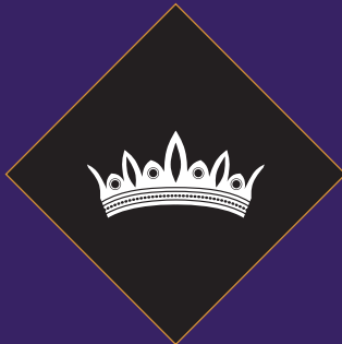
THE VISCOUNTS The support of the ICNC 2024