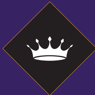
THE BARONS The courage of the ICNC 2024